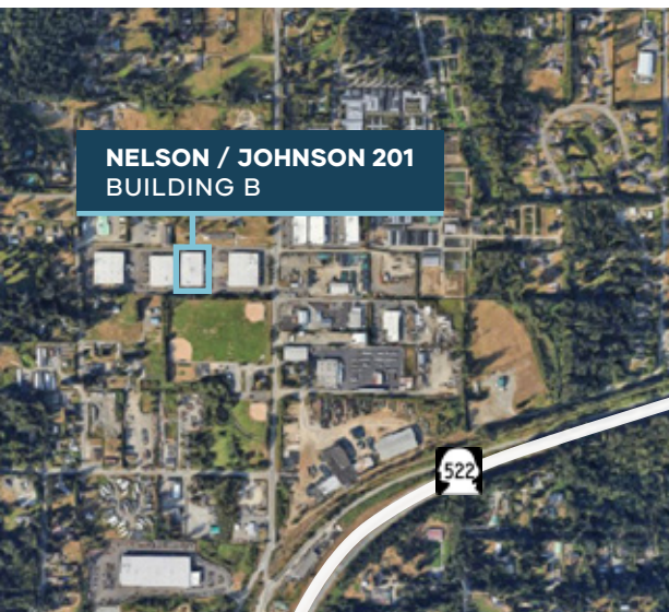
NELSON / JOHNSON 201 BUILDING B