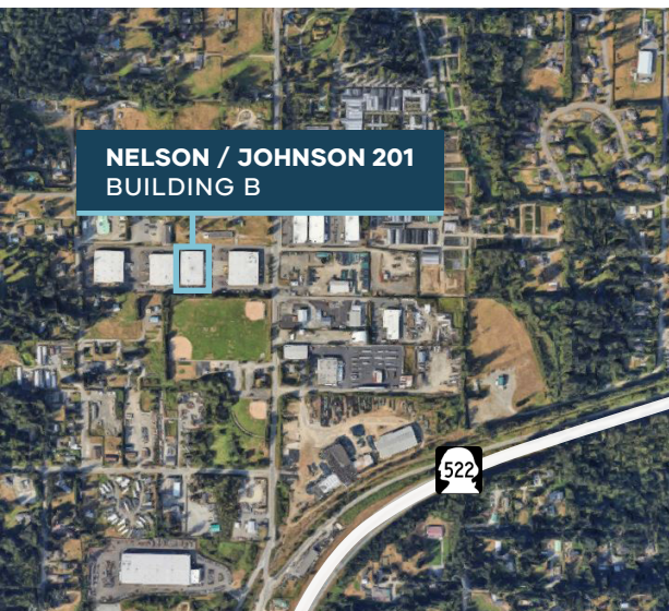
NELSON / JOHNSON 201 BUILDING B