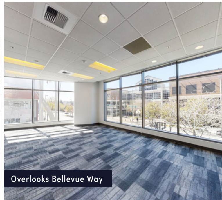
Overlooks Bellevue Way