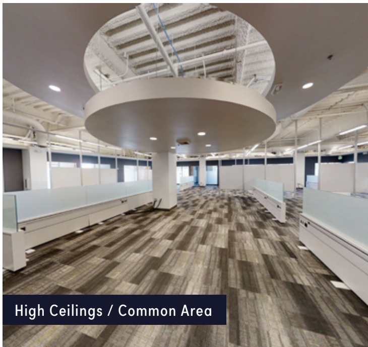
High Ceilings / Common Area