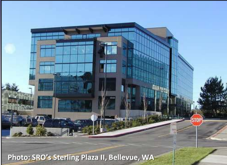
Photo: SRO's Sterling Plaza II, Bellevue, WA

I-5 & 128 th Street, Everett, Washington