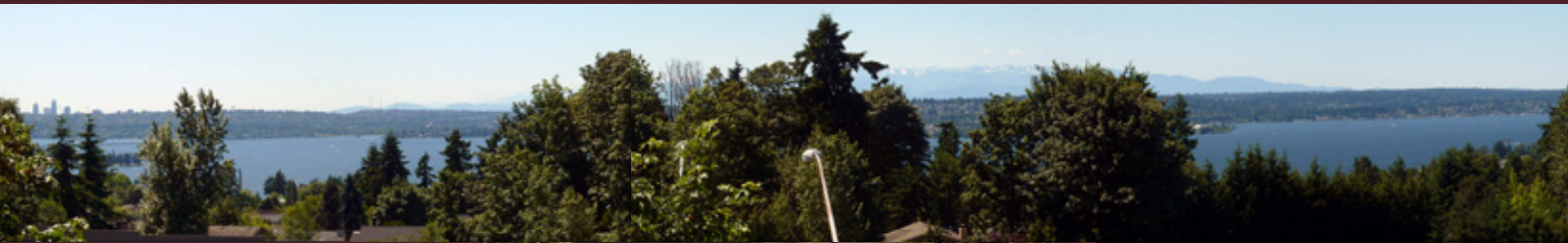
Breathtaking View of Lake Washington, Seattle skyline & Olympics from Lakeview Place