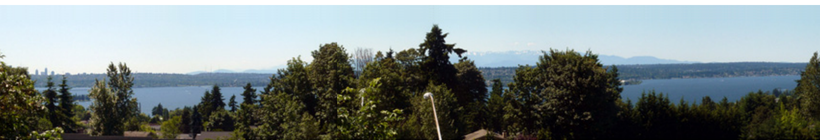
View of Lake Washington & Seattle Skyline from Lakeview Place

6725 116th Ave NE | Kirkland, Washington 98033