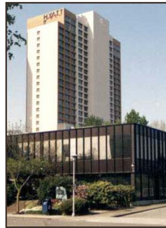
Bellevue Place amenities